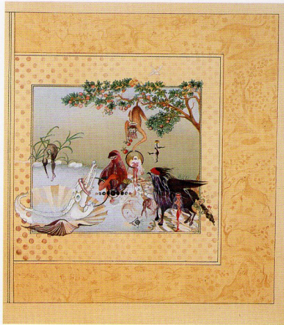
SHAHZIA SIKANDER Venus' Wonderland , 1997