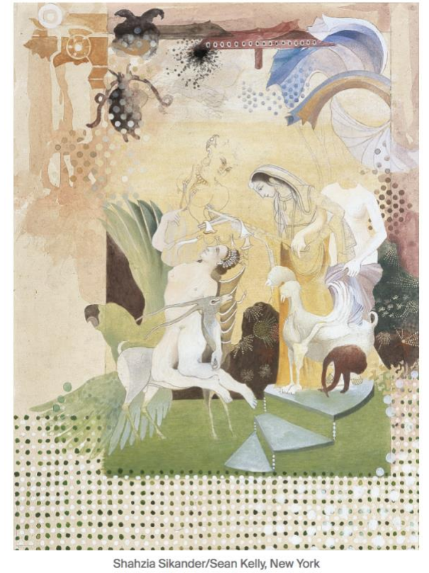
Shahzia Sikander: Intimacy, 2001