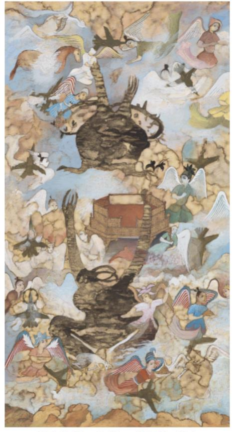
Shahzia Sikander: No Fly Zone, 2002