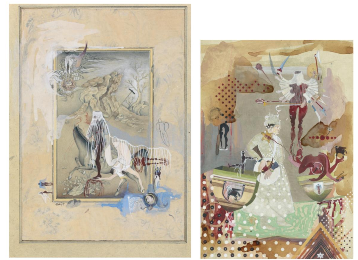
Shahzia Sikander/Sean Kelly, New York Shahzia Sikander: Who's Veiled Anyway ?, 1997