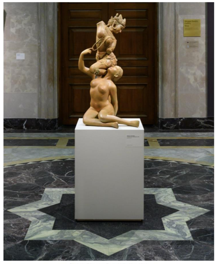
Shahzia Sikander/Sean Kelly, New York Shahzia Sikander: Promiscuous Intimacies , 2020

Even in summer, the rooms had no fans, because fans stir up dust. Students mixed their paints from pigments. They made wasli paper, and brushes from squirrel tail hair. They used seashells as palettes and black tea as stain. Students dipped their brushes in the tea and stroked them on the paper to create subtle layers of brown. Then there was tapai , a technique in which the artist uses a semidry brush to painstakingly lay on pigment and thus create those cloudlike gradations that first drew me to miniatures as a little girl, when I peered into the glass cases at the Metropolitan Museum of Art manuscripts stolen from the countries where they were painted. I knew, even then, that their creators had achieved something I never would. To paint like that required a meditative focus that was miles from my own internal jabber. I felt a sharp longing to be the sort of person who could make pieces as fine as those.