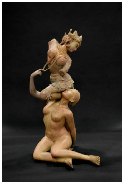
Promiscuous Intimacies, 2020. Patinated bronze, 42 x 24 x 18 in.

Eurocentrism has been operable throughout art history and history. When we inherit one-sided or polarizing constructions of the past, we often unconsciously keep marching down the same paths. My intent through the work I create is to help pause and reflect and open up conversations around contested issues, aiding toward more nuanced ideas about the world. One such current heated conversation is around the removal of colonial and Confederate monuments. In this wrestle to decolonize public education and history, it is imperative also to inspect the geographies of inequality through the question of gender.