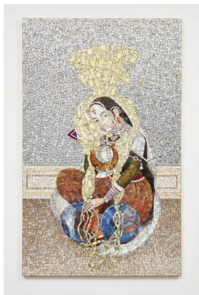
The Perennial Gaze , 2018. Glass mosaic mounted on plywood in brass frame, 70.25 x 43.25 in.

According to Gopinath, “Sikander’s work evokes the distinctions between self/other, inside/outside, foreign/native, masculine/feminine, human/nonhuman, only to render these distinctions porous and unstable. Sikander’s work traffics in promiscuous intimacies: the word ‘promiscuous’ is derived from the Latin miscere , meaning ‘to mix,’ and we can understand Sikander’s work as promiscuous in the sense that it lays bare the intimacies, the deeply imbricated nature, of apparently discrete aesthetic and cultural traditions, histories, and geographies.”