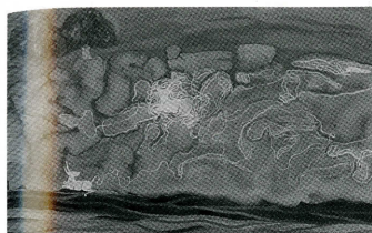
Shahzia Sikander, "Land-Escapes, Series 3, #7", 2003.

(Otis College, Ben Maltz Gallery, West Side) Shahzia Sikander (and by extension her work) is complexly situated. She is highly successful by Western art establishment standards, she is Muslim by background, Pakistani-born in this season of shock and awe gone grotesque; she is unveiled, jean clad,