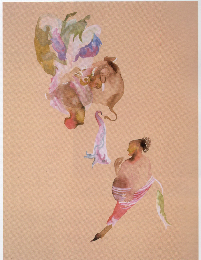
Shahzia Sikander, Flip Flop Series: To Extend . Ink and gouache on paper. San Diego Museum of Art, 2004.

The Pakistani-born artist Shahzia Sikander is renowned worldwide for her experimental approach to the highly codified traditions of Indian and Persian miniature painting. This spring, in a three-part project titled Flip Flop , Sikander turns the tables on a group of South Asian paintings from the Museum's Edwin Binney 3 rd Collection currently featured in Sultans and Sufis: Paintings from the Deccan . Part of SDMA's ongoing Contemporary Links series, her elaborate installation in the upper rotunda consists of a series of eighteen works on paper that correspond one-to-one to works in Sultans and Sufis , a dramatic site-specific composition of colored polyester film for the central staircase window, and a wall installation of paintings on dense layers of tissue paper.