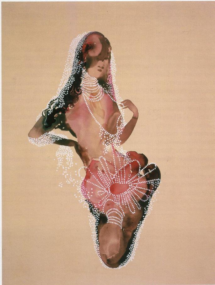
Shahzia Sikander, Flip Flop Series: To Reflect . Ink and gouache on paper. San Diego Museum of Art, 2004.