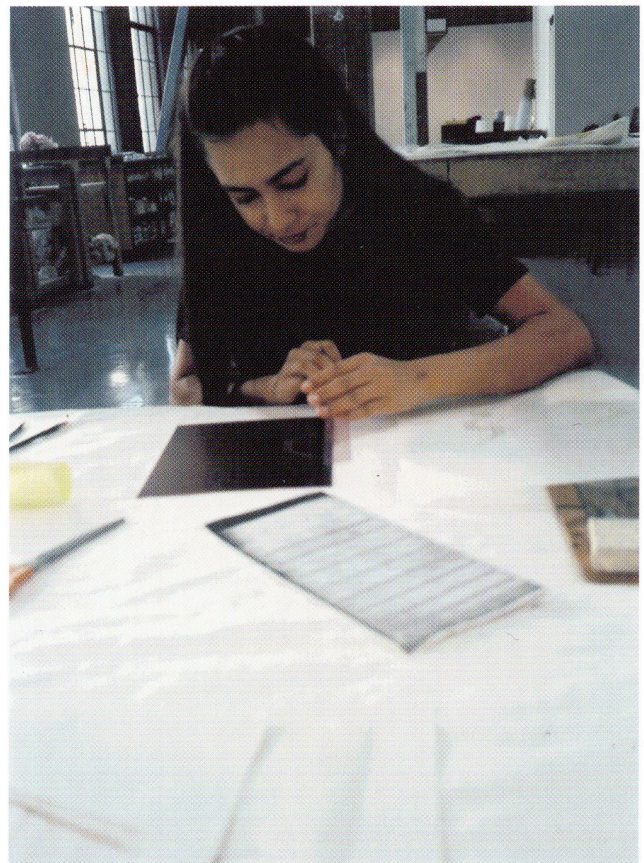
Shahzia Sikander in the Crown Point studio, 2001.

As she develops images, she overlays the thin paper she is drawing on with other drawings also in progress, and in this way discovers satisfying combinations. Once she has settled on a particular set of images, she uses them again and again in different media. Besides her work with miniature painting, she also has done a number of large wall paintings and installations that involve drawings done with whole-body gestural movements. Her installations, in particular, use layers of large drawings and often are put up in just a few days. They are a foil for her detailed miniature paintings that require