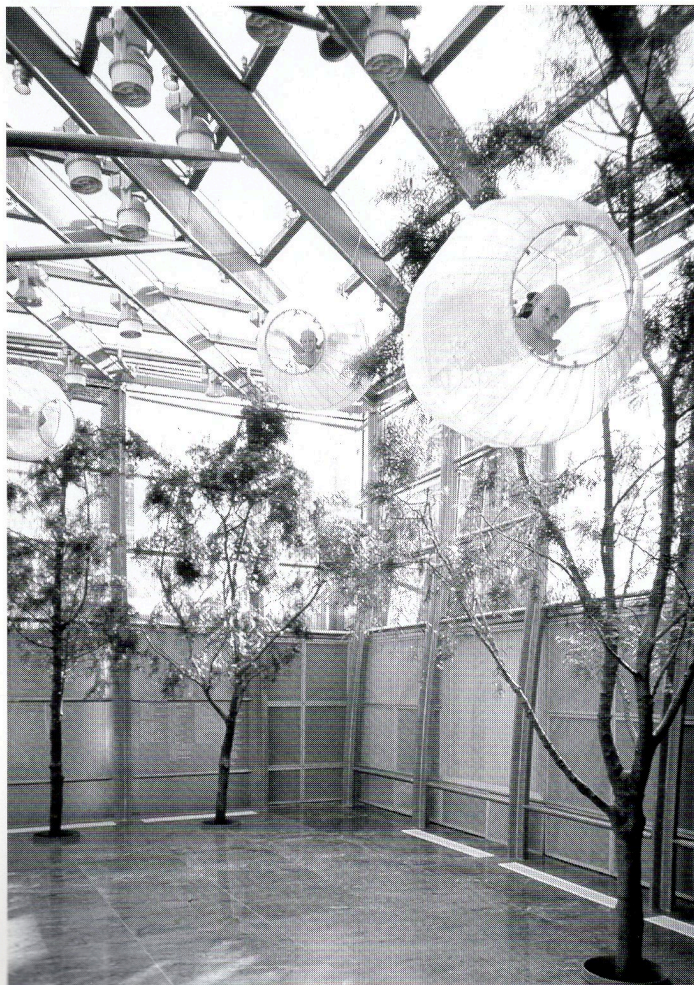
Opposite page: Heri Dono, Flying in a Cocoon, 2001, mixed media, dimensions variable.

“Conversations with Traditions: Nilima Sheikh and Shahzia Sikander” presents two artists, one from India, one from Pakistan, who transform ancient miniature traditions, now overlaid with a highly conscious political history. The Mughal style, the art of a Muslim court, was a centerpiece of the Lahore art school after Pakistan was arbitrarily created as a Muslim country in 1947. By the 1980s it also became a new variant of anti-colonialism; Shahzia Sikander, a Pakistani artist now living in New York, adopted it as a form of resistance to globalized modernism. In addition, part of her training and her life have been in the United States, and that identity and present reality also comes into her work, creating yet another negotiation with local culture.