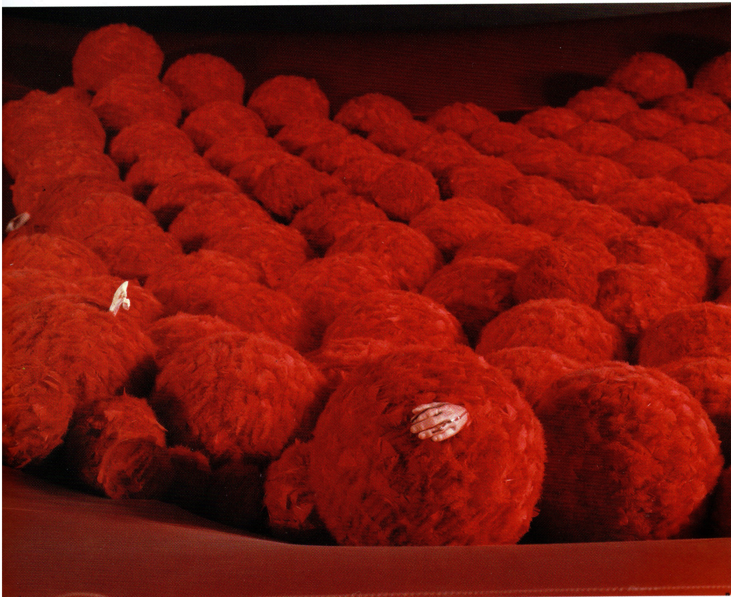
Regina Pape, Tupinambá Cloak , 2000, mixed media, 59 by 315 by 315 inches (artist's collection).

Perhaps her most radical decision was to feature contemporary artists who negotiate with the highly specific techniques of Indian