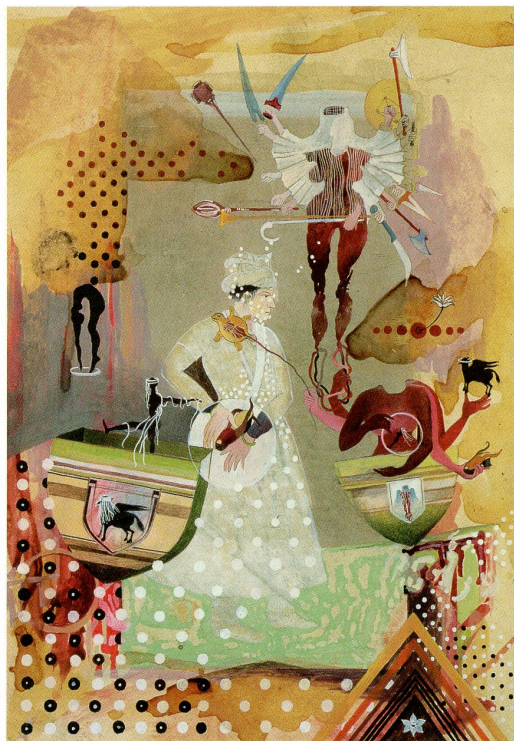
Hood's Red Rider (Series I, No. 2) , 1997 (checklist no. 17).

Although living thousands of miles from her homeland, Sikander is still inspired by South Asian culture. Her paintings on a clay ground pay tribute to the centuries-old folk art of rural Indian women who paint symbolic and abstract motifs on the earthen walls of their homes. In recent large-scale murals Sikander fastens overlapping layers of translucent paper, which partly veil the symbols painted behind.