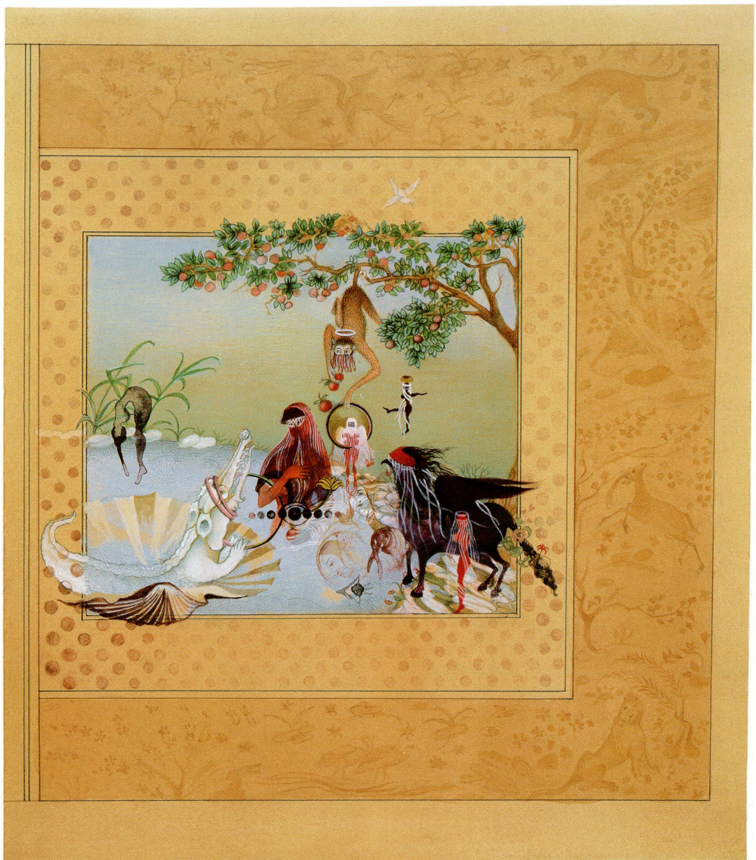
Venus's Wonderland , 1994–97 (checklist no. 27).