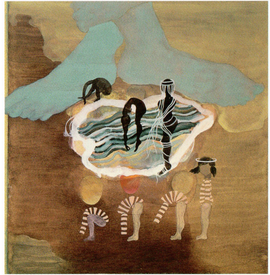
Walking a Thin Line , 1997 (checklist no. 28).

While the wall compositions usually have variable outlines, the artist sometimes delineates or implies a border—an act reflecting her observation that self-imposed structures and limits are useful amidst the incredible freedom of choices in America. And so Sikander continues to find support and inspiration in the traditions of miniature painting that launched her into the international art world.