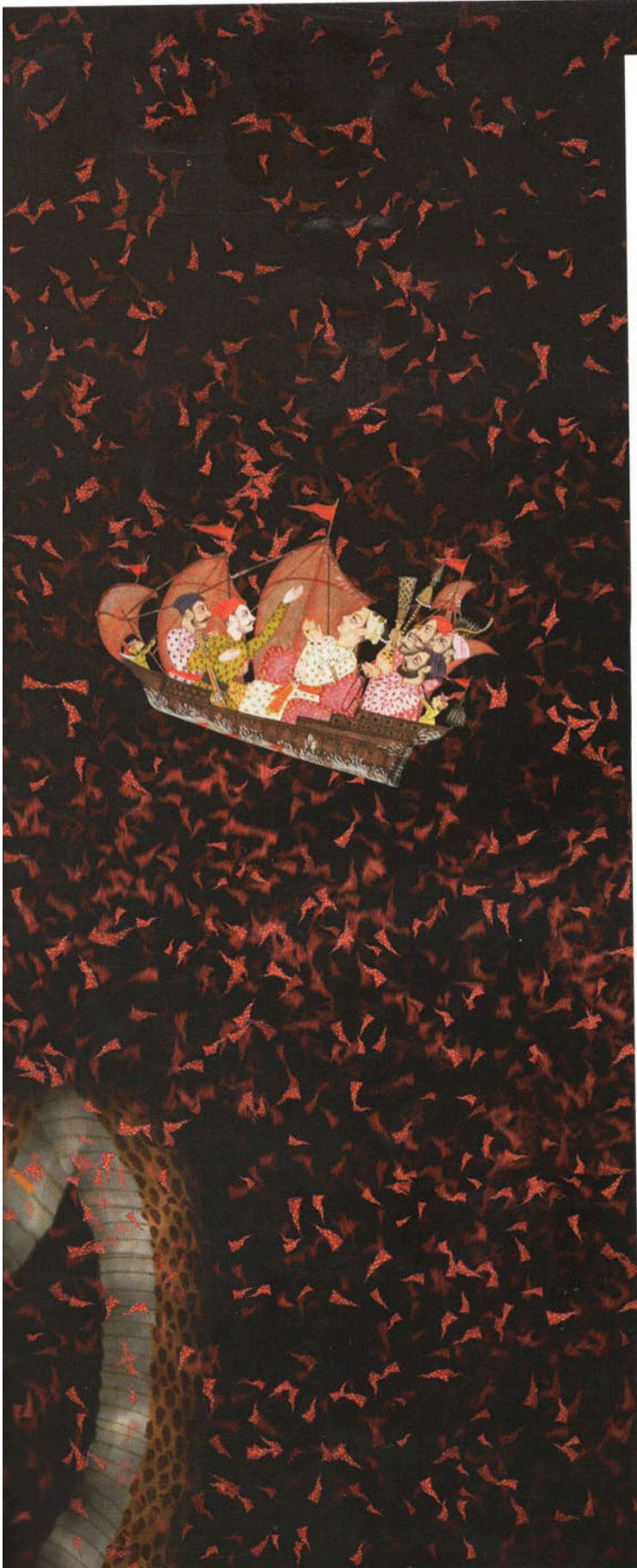
L and R: stills from 'Disruption as Rapture' (2016) Original music by Du Yun featuring Ali Sethi on voice HD video animation with 7:1 surround sound; 10:07 minutes Commissioned for Permanent Installation, South Asia Art Galleries, Philadelphia Museum of Art

Shahzia Sikander experiments with light, scale and touch in her recent animation inspired by a Deccan manuscript at the Philadelphia Museum of Art and her glass installations on Princeton University's campus. Vivek Gupta, a historian of Islamic and South Asian art, reviews the artist's latest works.