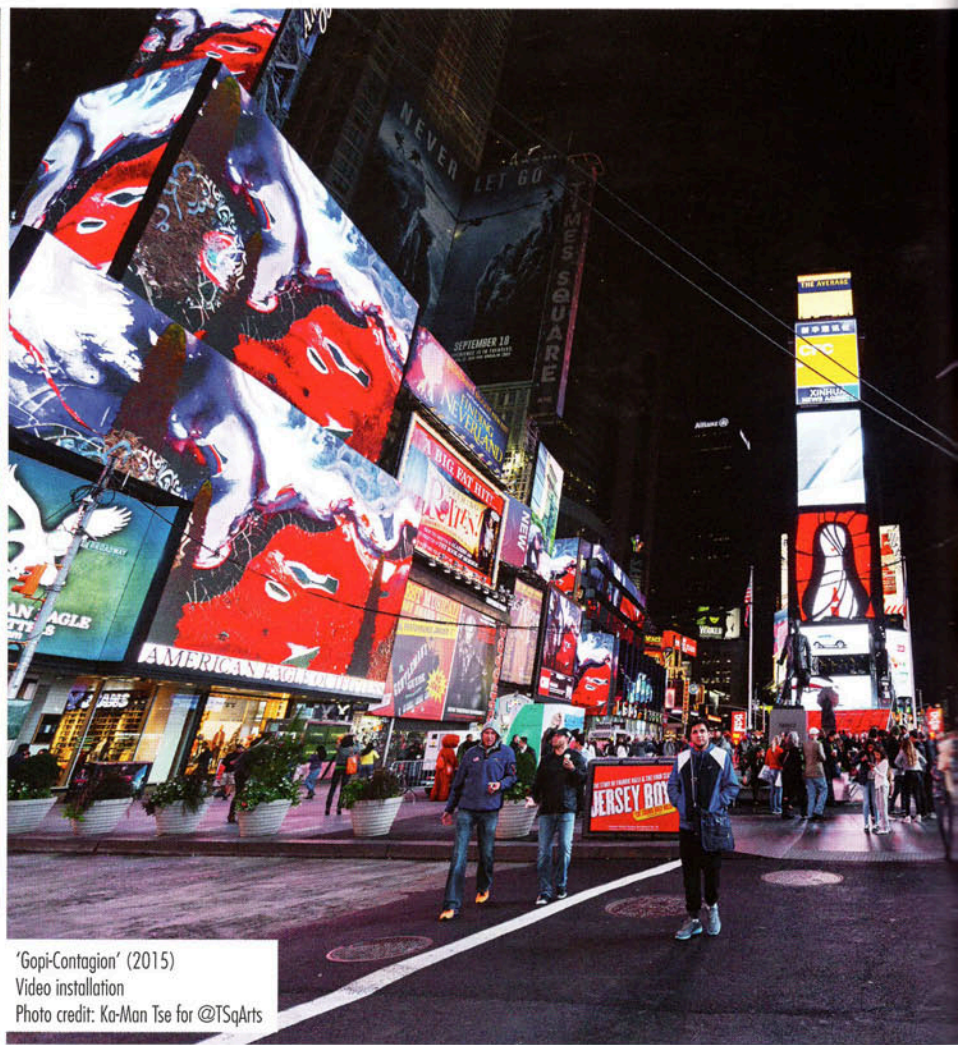
'Gopi-Contagion' (2015) Video installation

Of Sikander's latest experiments with light and scale are her works for Princeton's new Economics Department building is a sixty-six-foot painting. For both commissions, Sikander collaborated with Franz Mayer