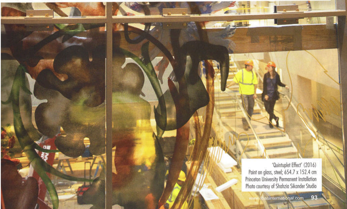
'Quintuplet Effect' (2016) Paint on glass, steel; 654.7 x 152.4 cm Princeton University Permanent Installation

Princeton University. The first of the two site-specific works for mosaic and the second is a twenty-five-foot multilayered glass of Munich, a German studio that is a leader in glass techniques