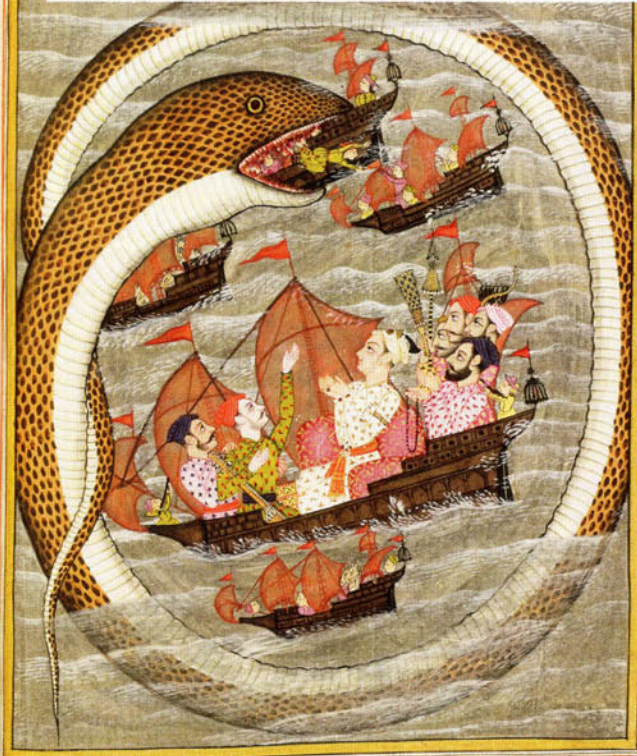
A still from 'Disruption as Rapture' (2016) Original music by Du Yun featuring Ali Sethi on voice HD video animation with 7:1 surround sound; 10:07 minutes Commissioned for Permanent Installation, South Asia Art Galleries, Philadelphia Museum of Art