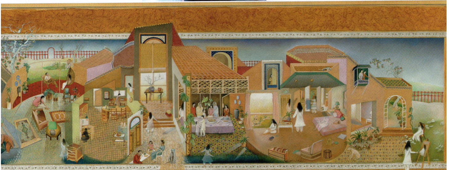
The Scroll , 1989-90, watercolour, gouache, tea wash, gold leaf on wasli paper 14 x 67 inches

Her paintings received accolades in Pakistan, emboldening her to accept an invitation to display her