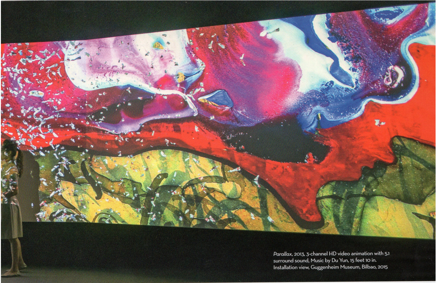
Parallax , 2013, 3-channel HD video animation with 5.1 surround sound, Music by Du Yun, 15 feet 10 in. Installation view, Guggenheim Museum, Bilbao, 2015

figure – referred to as ‘The East India Company man’ – shatters into a million fragments. In her continued efforts to subvert traditions, she repeats symbols that, when disjointed from their contexts, add new layers to her work. One example is ‘Gopi-Hair’, the black shapes that also feature in Gopi-Contagion . These are in fact thousands of drawings of the hairstyles of Krishna’s gopis , disembodied and turned into abstract forms that flow across the screens. “Tradition and identity are inherited to a certain degree and to grow as an individual, we sometimes have to branch off or forgo those strings in order to achieve something original. Contemporaneity is about challenging the status quo.”