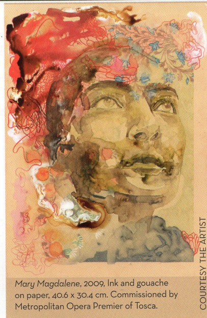
Mary Magdalene , 2009, Ink and gouache on paper, 40.6 x 30.4 cm. Commissioned by Metropolitan Opera Premier of Tosca.

Embracing ethnic heritage and diverse cultures is something she’s passionate about. She shuns the increasing anti-Muslim sentiment in the US, continuing to live in New York City and raising her son with the same pluralist values that she grew up with. She shuttles between homes and studios in New York, Lahore and Seville, and wherever work takes her. “As a transnational artist I have