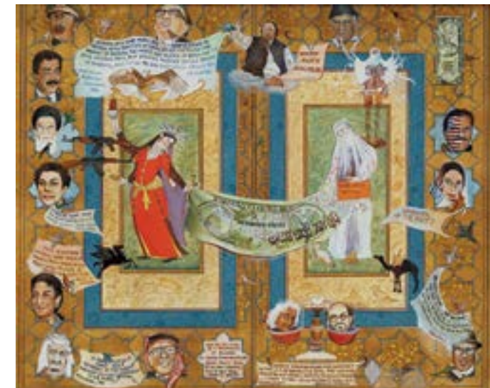
BOLD ART (LEFT) THE MANY FACES OF ISLAM, 1997-99, 14 X 18 INCHES