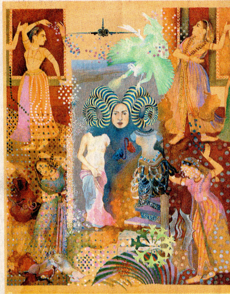
Museum of Modern Art

The cartoon issue isn't primarily an art story, any more than the destruction of the mosque at Ayodhya in India was an architecture story, or the censure of "The Satanic Verses" was a story about contemporary fiction. It's a political story, an ancient and universal one, about how an im-