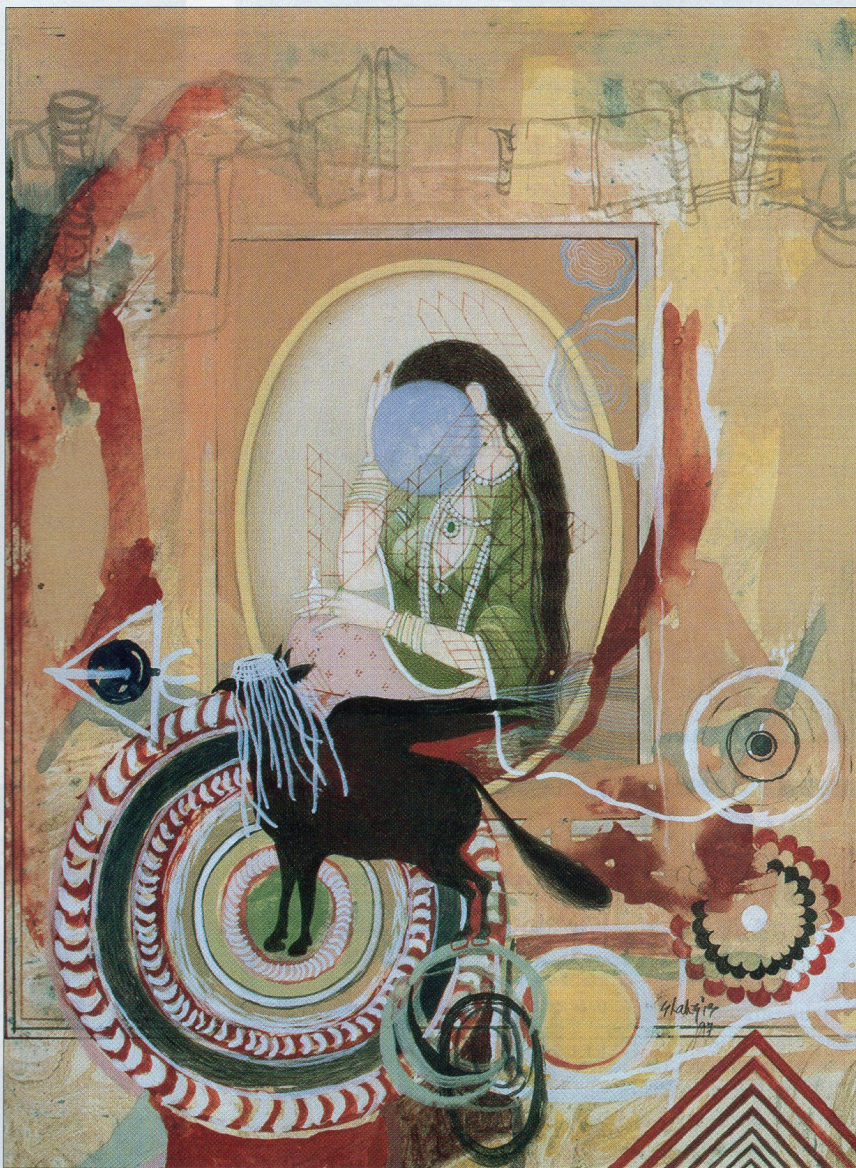
Sikander applies the technique of traditional Mughal miniature painting (below left) to works that speak to a contemporary audience. Ready to Leave , 1997 (above).

The artist's hallmark is a floating female figure who wears a white veil and has a loop of ribbons in place of legs and feet. Often depicted with multiple arms that carry a wide range of weapons, she is like Durga, slayer of the buffalo-demon in Hindu mythology, except that in Sikander's version, the weapons are primarily signs of power, not implements of aggression. "She floats to show that she is not grounded in anything other than herself," the painter explains. Sometimes Sikander's figure is blue, the color of a male god. Always, she is a wondrous chimera and a powerful presence.