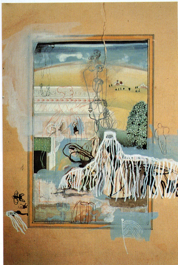
Shahzia Sikander, Separate Working Things, 1995. vegetable color, dry pigment, watercolor, tea on wasli handmade paper, no dimensions given.